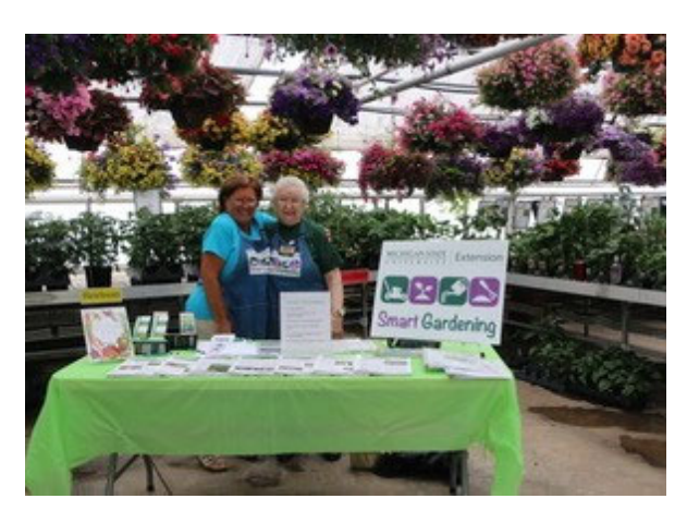
The Lansing Home and Garden show is hosted in late spring and attracts thousands of people from the Mid-Michigan region and beyond.