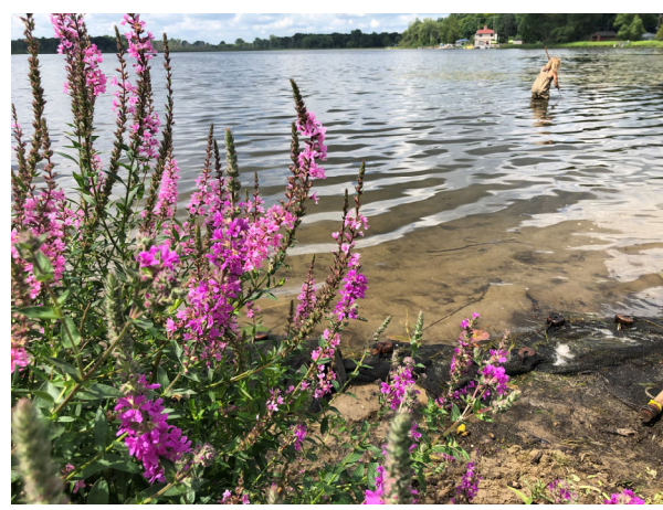
Aquatic invasive species are often spread unintentionally on boats and trailers. Once introduced, they are difficult and expensive to manage.

Cabin Fever Conversations is a cross-institute program that began during the height of the COVID-19 pandemic. As people returned to "normal" life in Michigan and throughout the world, somethings discovered during the lockdowns were retained. Cabin Fever Conversations was such a program. Now in its third iteration, Cabin Fever continues to bring gardeners together for lighthearted and educational conversation. These conversations drew people from across Michigan and were hosted by our Ingham County staff. The program takes place online allowing for a large, diverse audience. In 2022, there were 509 program participants from 56 Michigan counties and 21 participants from other states.