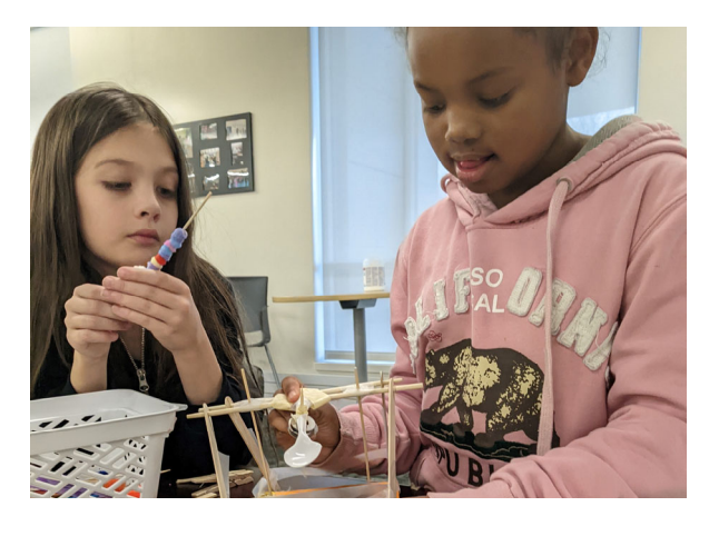
4-H youth work together on a "Junk Drawer Robotics" project as part of 4-H Exploration Days on the campus of Michigan State Univerrsity