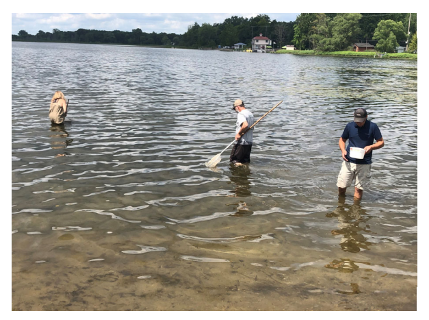
The Introduction to Lakes Online course was created by MSU Extension Educators and faculty members in the MSU Fisheries and Wildlife Department. Since 2015 over 1,500 people have enrolled in the course.